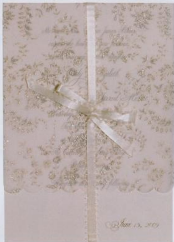
Flat-card invitation with glitter-patterned vellum overlay and hand-tied satin ribbon by Anna Griffin ; annagriffin.com, 888.817.8170.