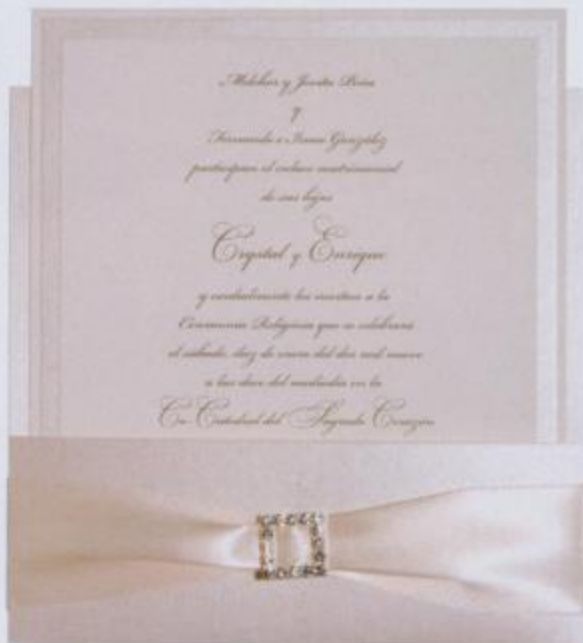
Pocket-fold custom invitation suite with rhinestone brooch on satin-ribbon embellishment by Invitation Solutions ; invitationsolutions.com, 713.864.5573.

Crystals and glitter add upscale sparkle to creamy invitations.