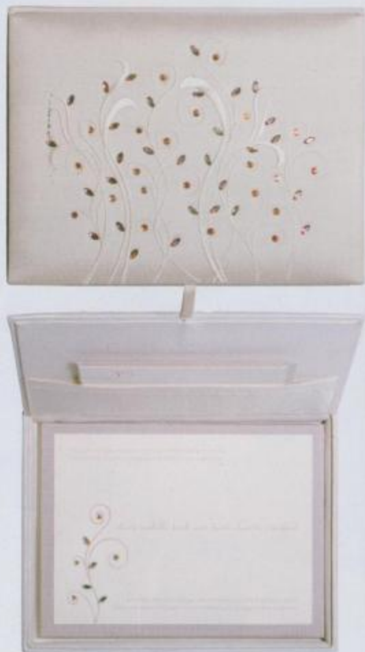
Custom invitation, response card, and silk-lined box adorned with Swarovski crystals by RedBliss ; redbliss.com.